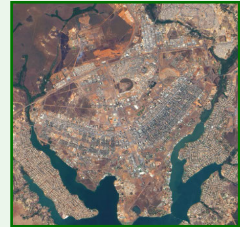
A satellite view of Brasilia

The architect and urban planner, Lucio Costa, planned the new city. It was designed in the shape of an aeroplane - the 'wings' were where the housing would be, the 'main body' would be where the offices and shops were located, and the 'cockpit' would be where the presidential palace was built. Costa also included lots of open spaces and roads - it was a city to move around in by car, rather than on foot.