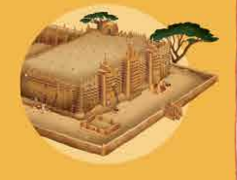
Mosque of Djenné