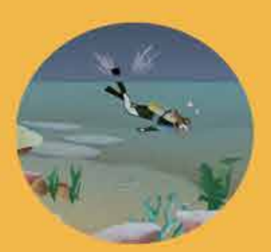
The Great Blue Hole