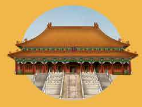
The Forbidden City

Everywhere you look, there's something to amaze you. It might be a beautiful flower pushing up into the sky. Or maybe it's a beach or forest campground you visit on vacation.