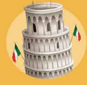
The Tower of Pisa