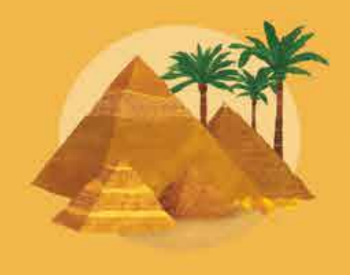
The Pyramid at Giza