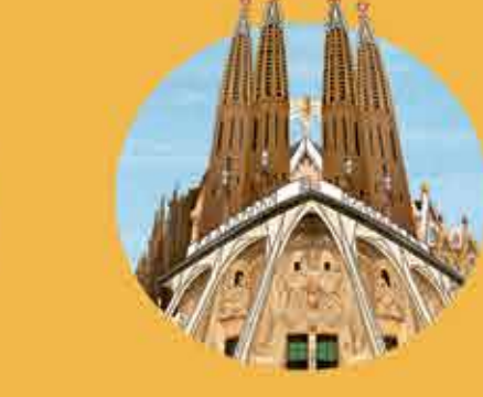
La Sagrada Família