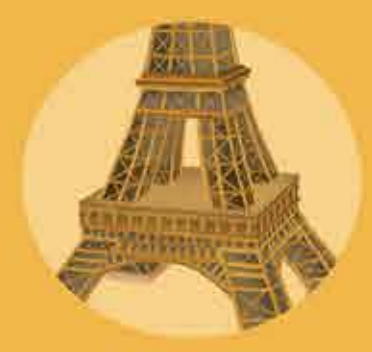
The Eiffel Tower