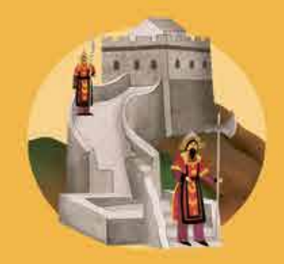
The Great Wall of China