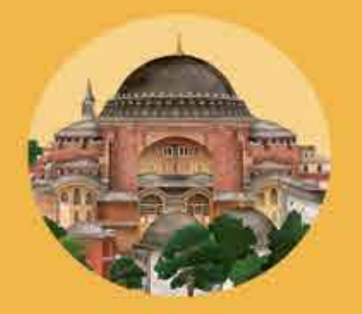
The Hagia Sophia