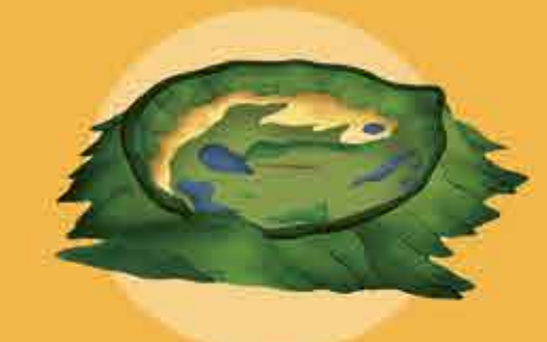
The Ngorongoro Crater