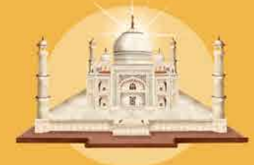
The Taj Mahal