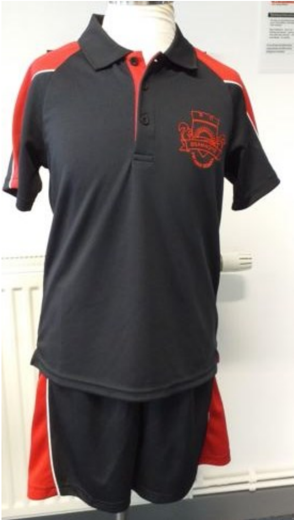
PE Girls - v-necked sports t-shirt and skort