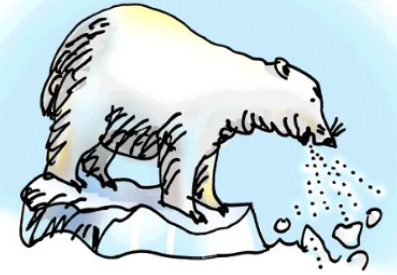
blow the snow

2. high , night , light , fright , bright , sight , might