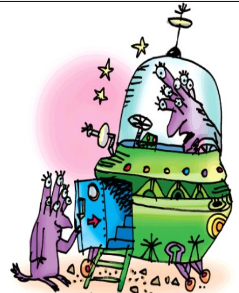
shut the door

2. car , bar , star , park , smart , start , sharp , spark